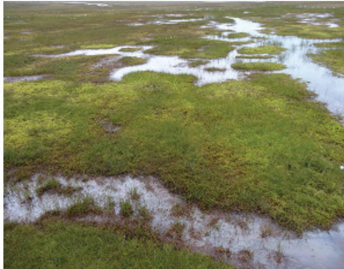
Figure 4: Fen with yellow-brownish coloured bryophytes (mainly Aulacomium turgidum ) and the graminoids Tundra grass ( Duopontia fisheri ) and Arctic Cotton grass ( Eriophorum scheuchzeri ). This plant community was better separated in the RGB image than in the NDVI image.

sub-community levels within or between plant communities and vegetation types (e.g. the wet moss tundra and mires dominated by the mosses Aulacomium turgidum and Tomentypnum nitens and the sedges Carex saxatilis , Eriophorum triste and Eriophorum scheuchzeri ). The latter is also a challenge in the Landsat-based study of the study area (2).