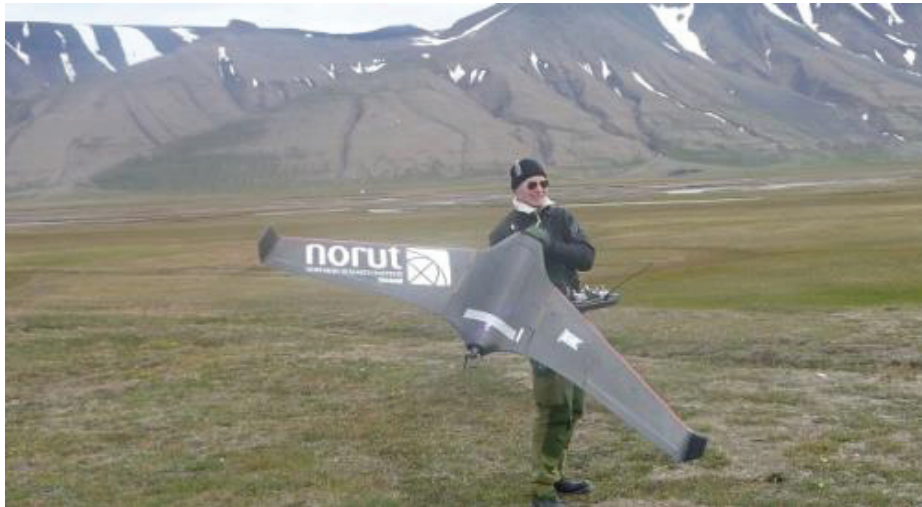
Figure 2: A fixed wing UAS used to measure NDVI over high arctic vegetation communities.

NDVI camera as for the S230 NDVI camera in order to avoid differences in measurements and to facilitate post processing. The community level measurements were taken 1.5 m above the surface, while measurements of the species level were taken 0.5 m above the surface.